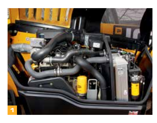
We've equipped these AGRI Loadalls with a large, wide service bay that's accessed via a gas-assisted bonnet. This setup allows fast and easy inspection around three sides of the engine.

Every fluid filter (engine oil, hydraulic oil and fuel) is centrally located for fast, easy servicing. The air filter is easily accessed too, and its double-element design simplifies cleaning.